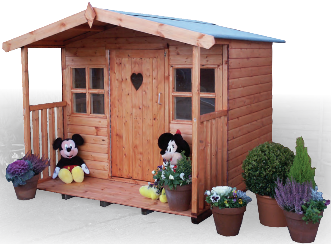
6' x 4' + 2' Balcony