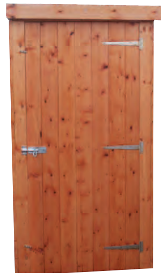
3' x 3'