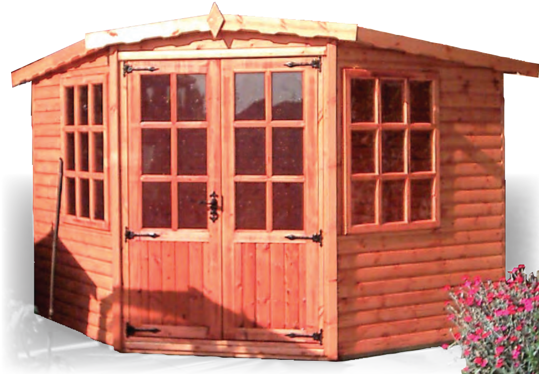
8' x 8'