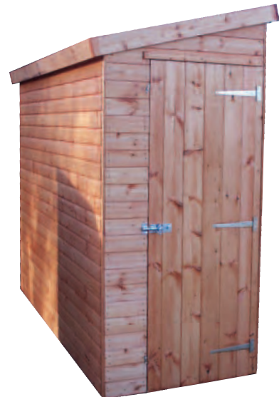
8' x 3'