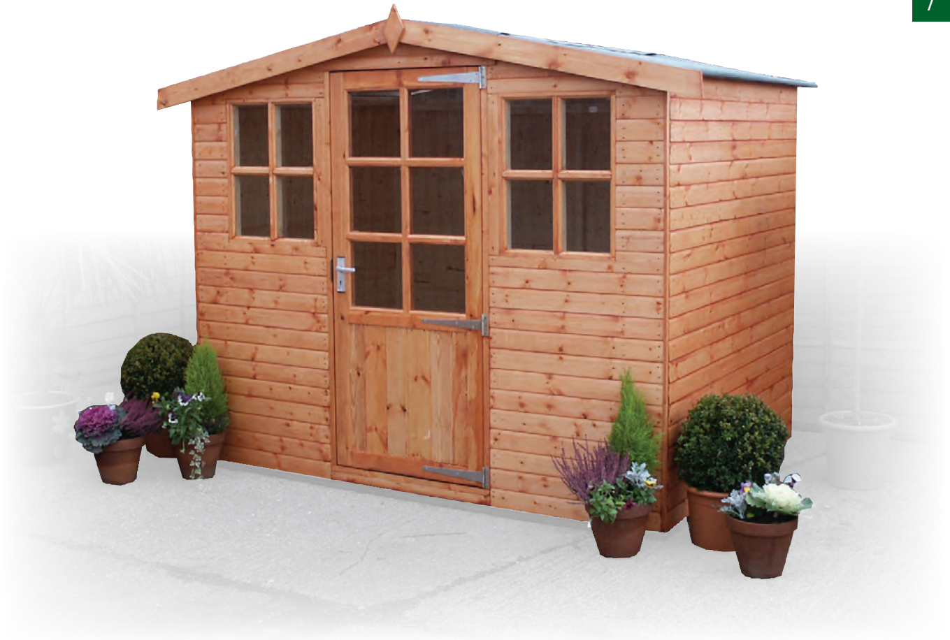
8'x 6' Georgian