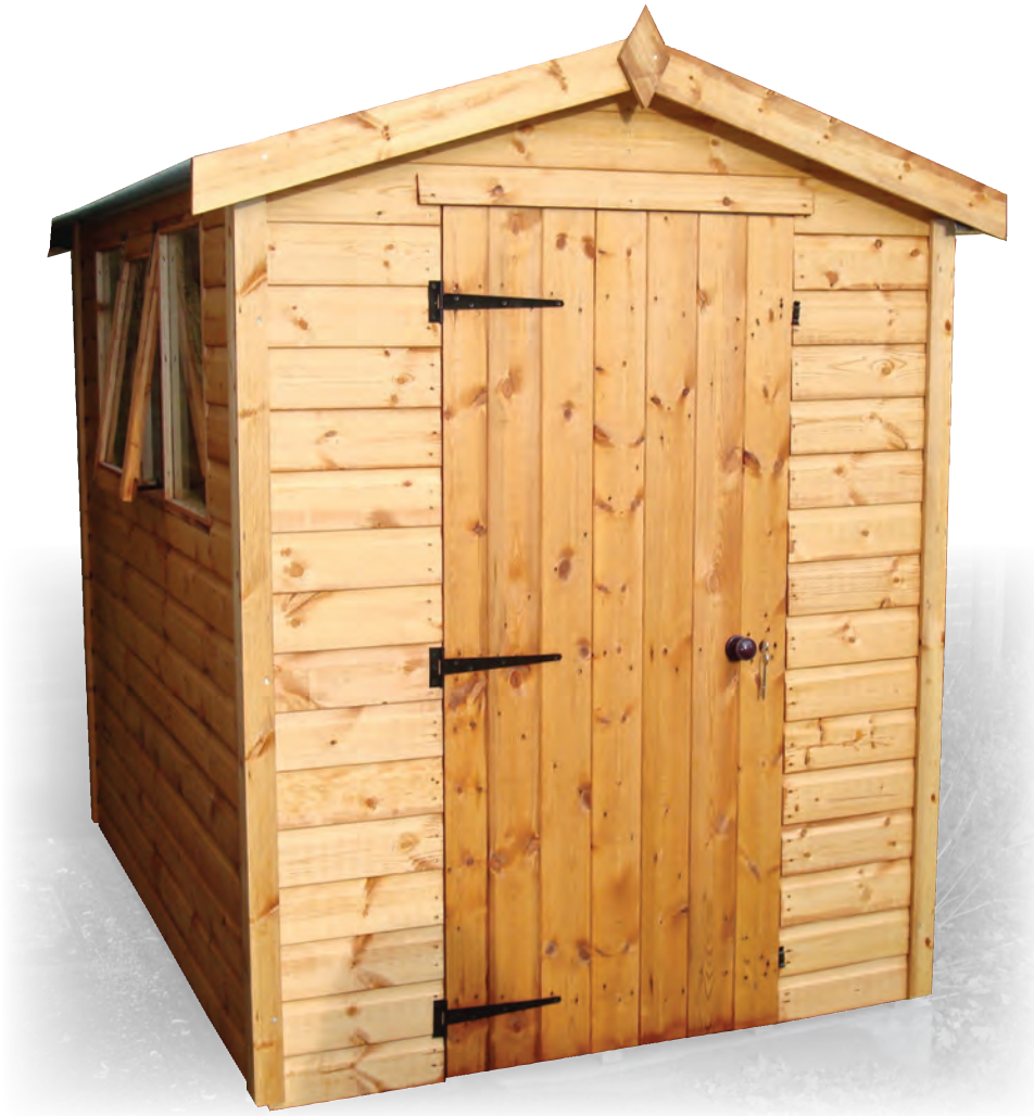
7'x 5' Classic