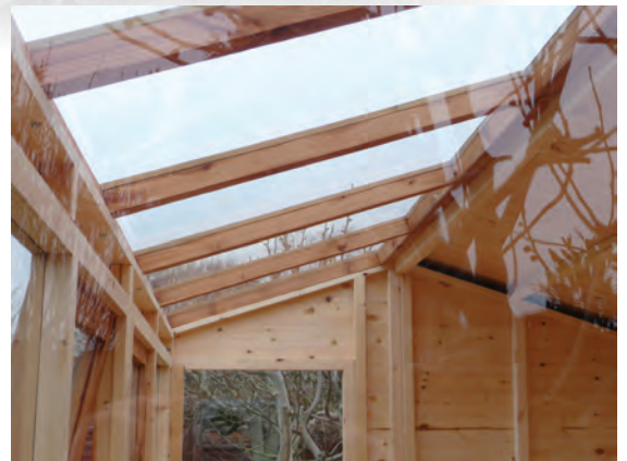
Internal View of Glazed Roof