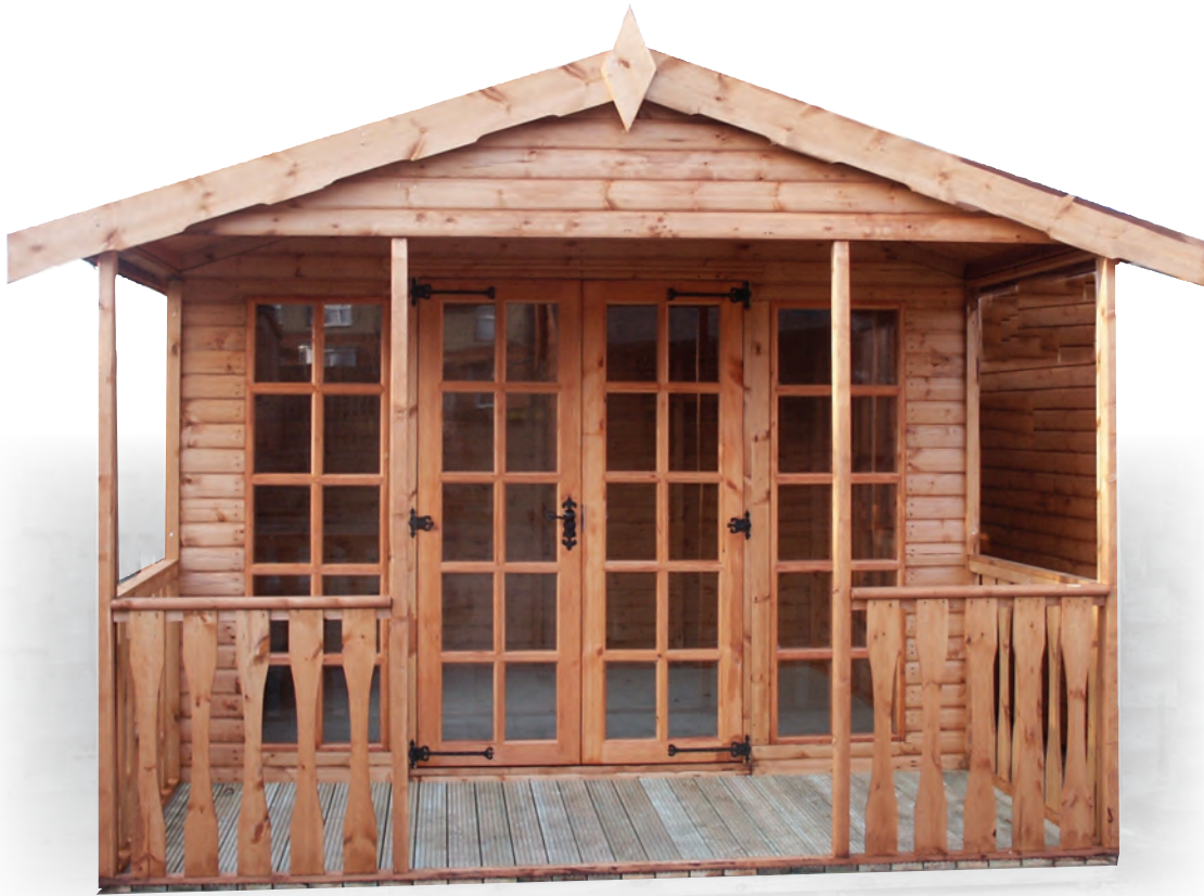
10' x 8' + 4' Balcony