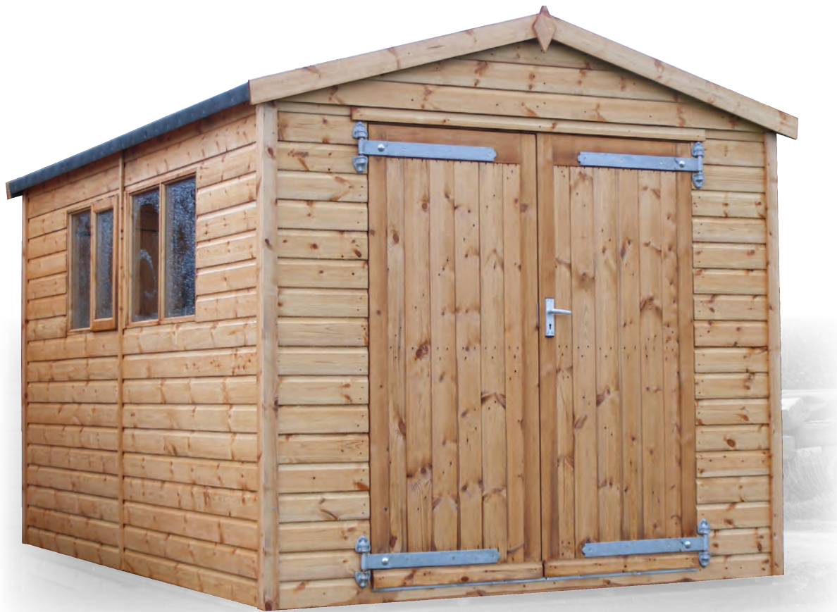
12'x 6' Classic