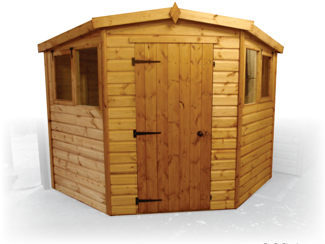
7' x 7' Classic