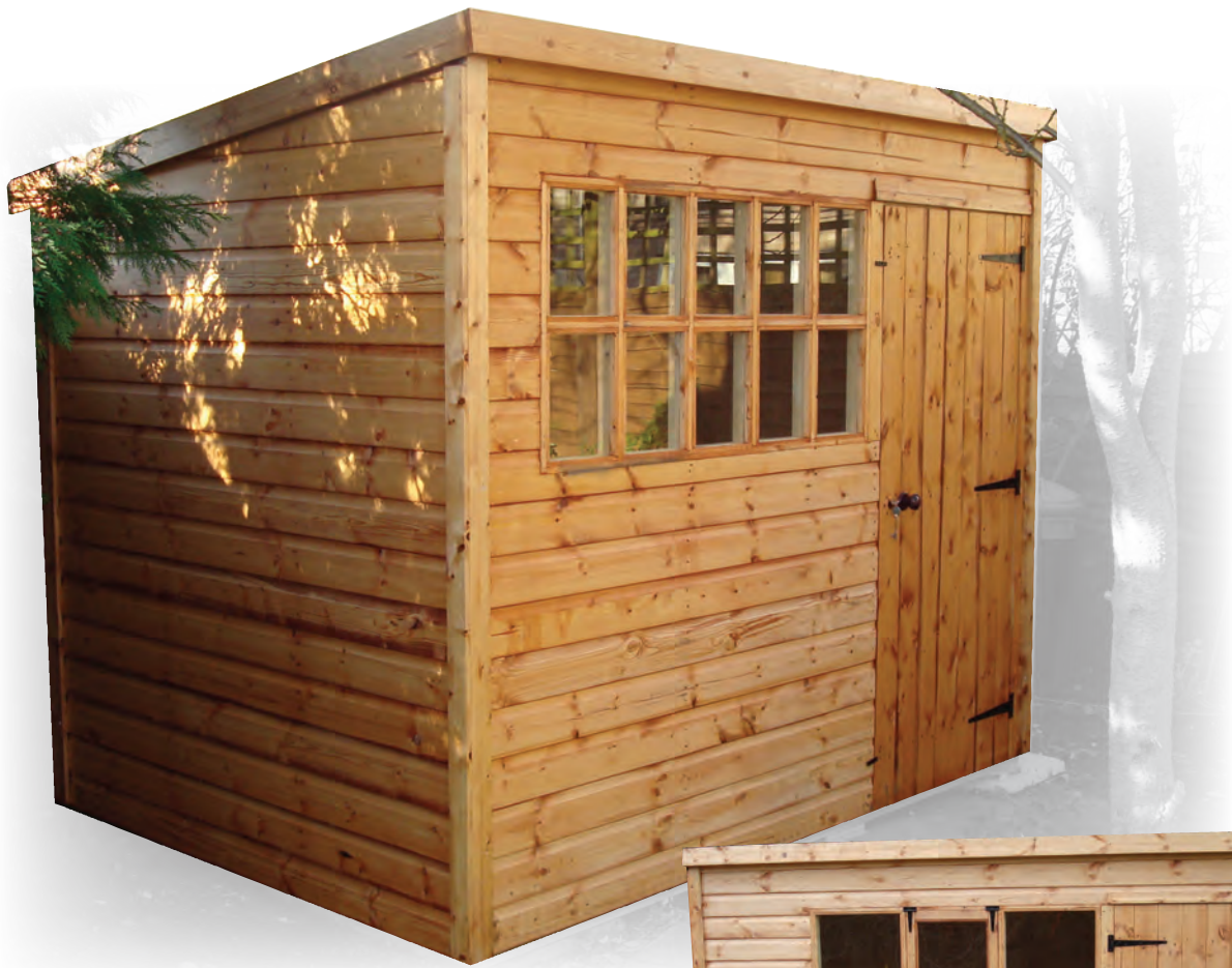
8'x 6' Georgian