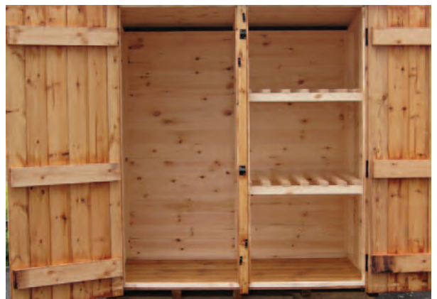
Internal View of Refuse Store