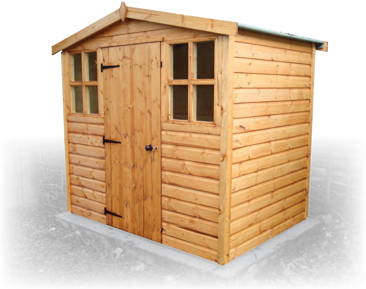
7'x 5' Georgian