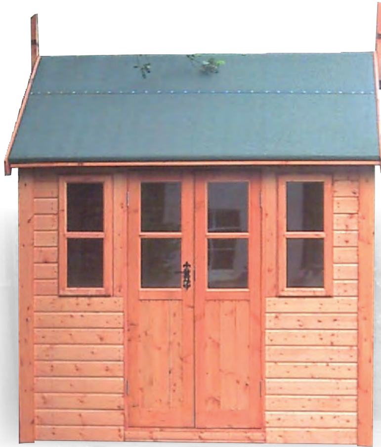
8' x 6'