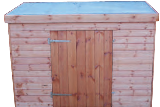
6' x 2'6"