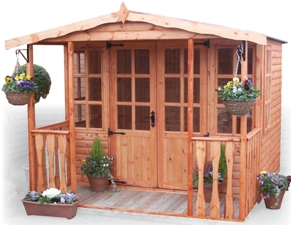
8' x 6' + 3' Balcony