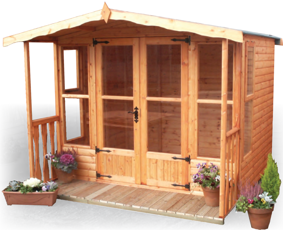
8' x 6' + 2' Balcony