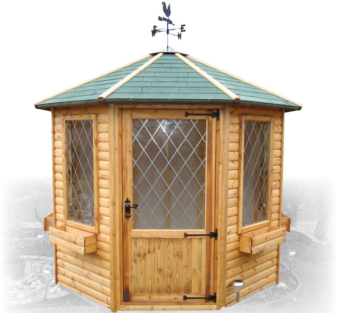
8' x 8' Diamond Lead Light