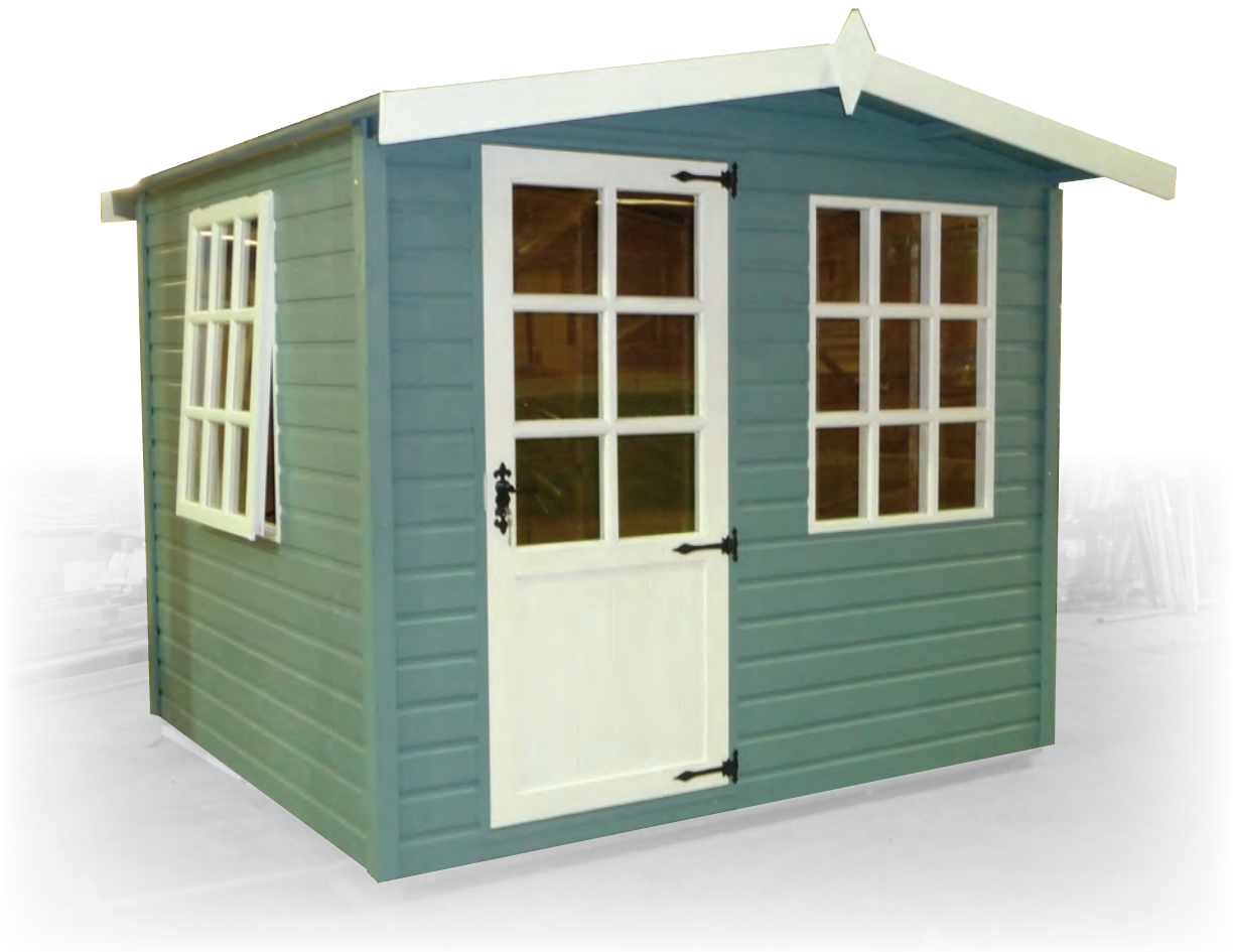
8' x 7' Building shown in colour treatment - optional extra.